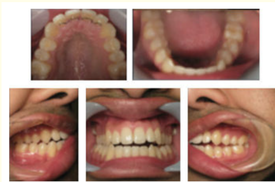
Figure 2: (Anterior openbite with wire fixation max and mand).